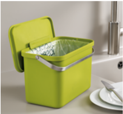
Food waste caddy