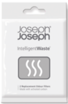
Replacement Odour filters Pack size: 2

At Joseph Joseph we love solving everyday problems through intelligent design. Be it for the kitchen, bathroom or utility room, we apply the same inventive thinking to everything we do. Our mission is to create desirable products that enhance everyday life and that stay true to our philosophy of creating Brilliantly Useful Design .