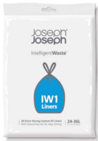
IW1 Extra-strong custom-fit liners 24-36 Litres Pack size: 20

Whilst all our bins and caddies are compatible with standard plastic liners, we offer extra-strong custom-fit liners for added peace of mind. We also provide replacement odour filters for the full range.