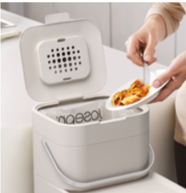
Food waste caddy with odour filter