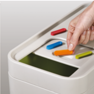
Colour-coded lid tabs