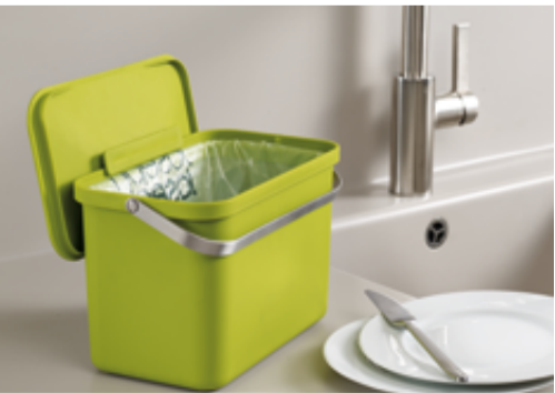
Lid stores on side