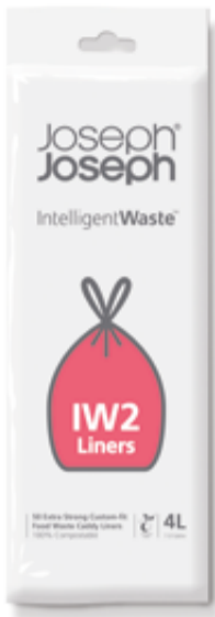
IW2 Extra-strong custom-fit liners 4 Litres Pack size: 50