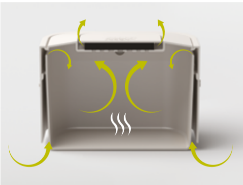
Ventilated design reduces odours