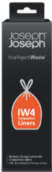
IW4 Extra strong custom-fit compaction liners 30-90 Litres Pack size: 20