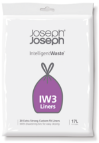
IW3 Extra-strong custom-fit liners 17 Litres Pack size: 20