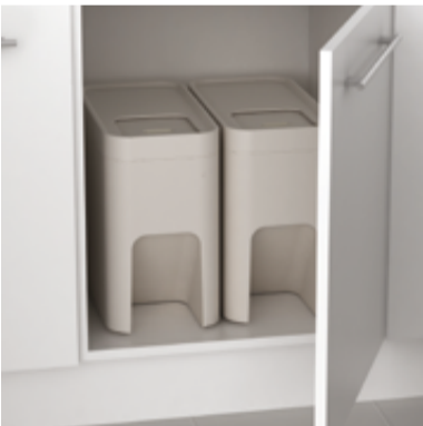
Stack or fit inside cupboards