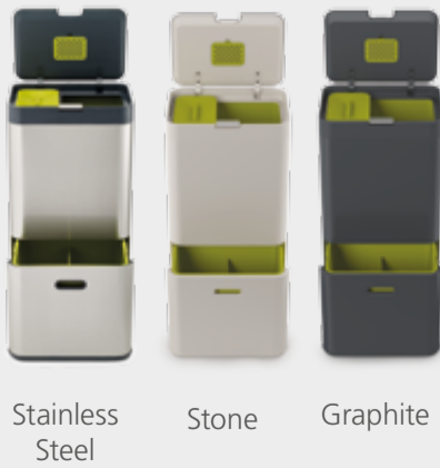
Stainless Steel Stone Graphite