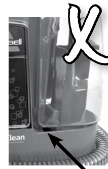
loose fit with gap

If you require assistance with any of the above steps or have any questions or concerns, please visit www.BISSELL.com , or call BISSELL Consumer Care as follows: